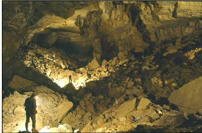
The Time Machine, Ogof Daren Cilau, Llangattock is one of the largest cave passages in the UK

Whitewalls is superbly situated for caving. The adjacent Mynydd Llangattock limestone massif has some of the longest and largest caves in the country with over 65 km of explored passages in three major cave systems: Ogof Craig a Ffynnon, Ogof Darren Cilau and Agen Allwedd. The latter two caves are within walking distance of the cottage.