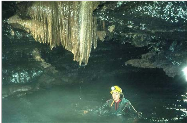
Crossing the lakes in Dan-yr-Ogof