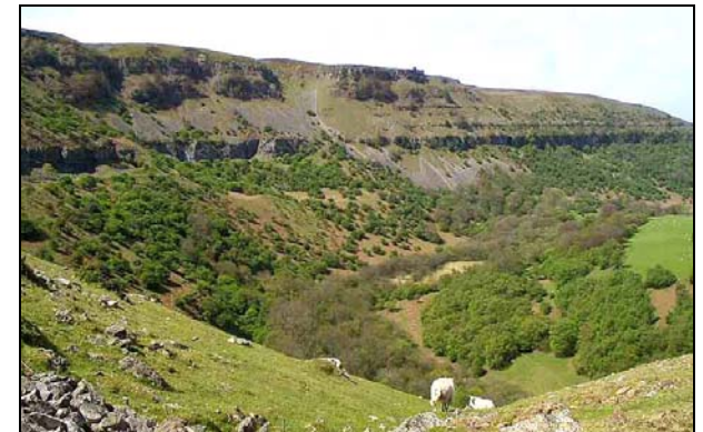
Craig y Cilau National Nature Reserve

The club arranges many caving trips, often on an informal basis, as well as organised social events including dinners, BBQs and a bonfire party. The club provides a regular pub meeting for its members who work in the London area.